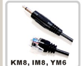
KM8, IM8, YM6